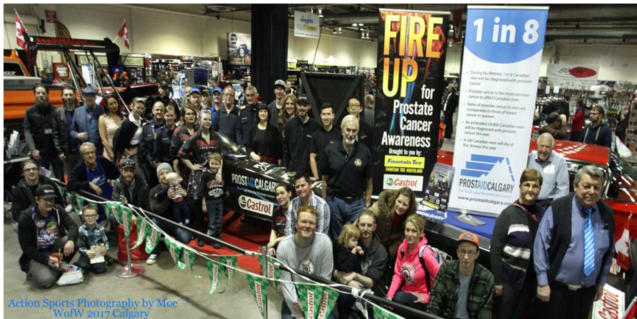
Action Sports Photography by Moe WofW 2017 Calgary